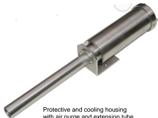
Protective and cooling housing with air purge and extension tube